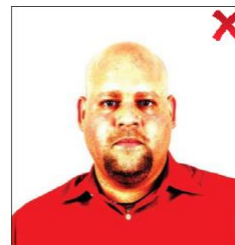
Contrast too high