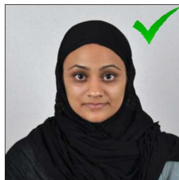
Scarf worn for religious reasons; full face oval is visible