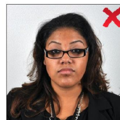
Glasses cannot be worn