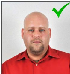
Correct contrast and color