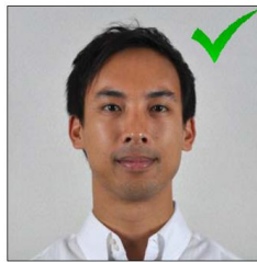
Correct size and position