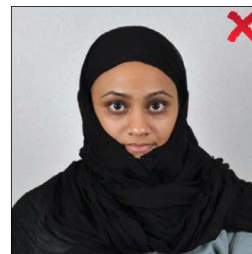
Headscarf covers portion of the face