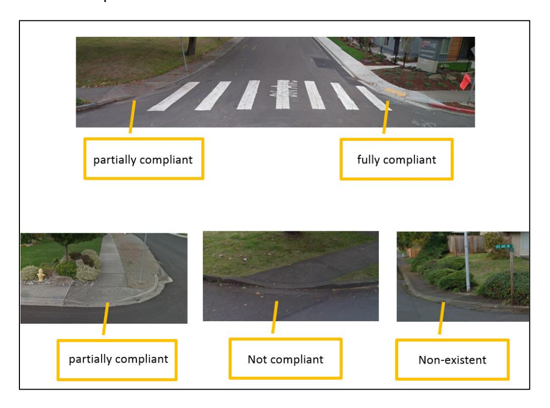
FIGURE 2 IMAGES ABOVE SHOW DIFFERENT SIDEWALK CONDITIONS AND INDICATE WHICH ARE FULLY, PARTIALLY OR NON- COMPLIANT AND NON-EXISTENT

A curb ramp assessment was completed in 2015 in conjunction with a sidewalk assessment. The following images illustrates the criteria used to determine the level of ADA compliance for the curb ramps.