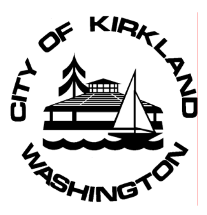
May 8, 2006

Based upon the U. S. Mayors Climate Protection Agreement endorsed by the City of Kirkland on May 17, 2005