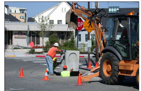
Kirkland's crews install a catch-basin.

Sometimes, these crews will install curb, gutters and catch basins—also known as storm drains—during this process. These structures reduce flooding potential by promoting the flow of runoff. Residents can help reduce flooding potential in their