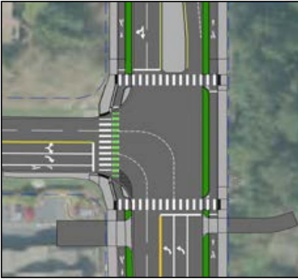
The Simonds Road intersection will feature more turn lanes.