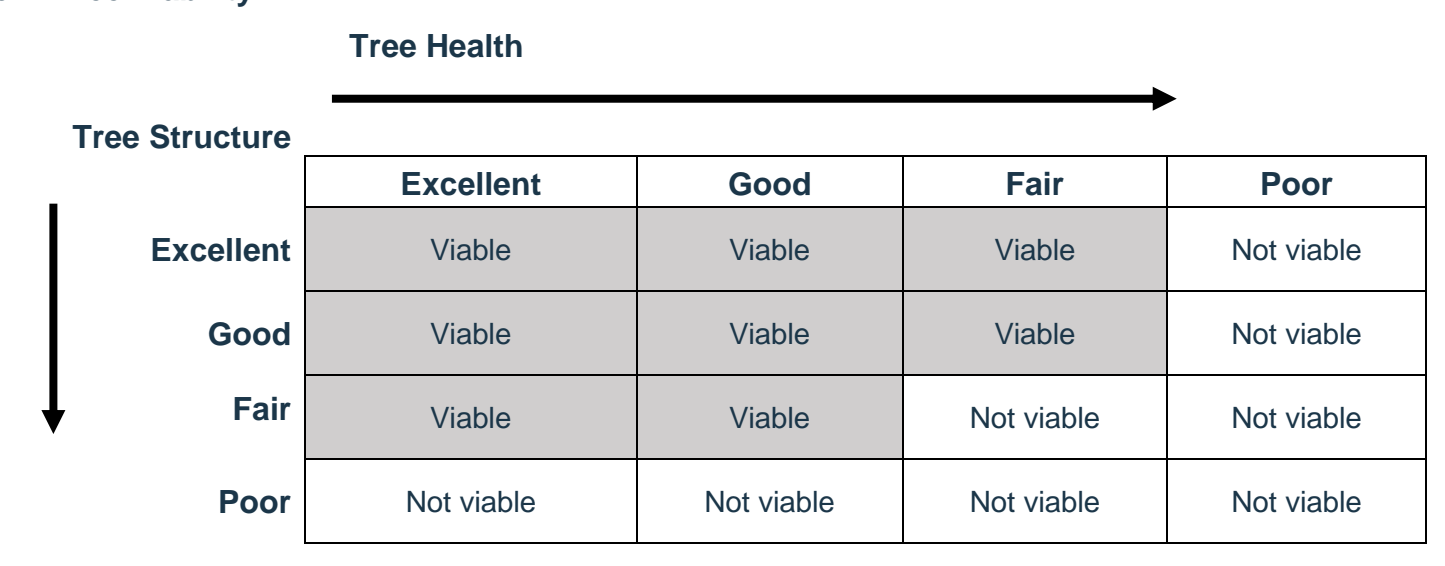
Table 2. Tree Viability

Based on the condition ratings for health and structure in Table 1, the tree's overall viability shall be assessed as follows in Table 2: