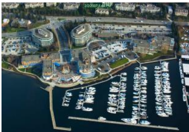
Carillon Point Marina

Policy SA-1.3: Maintain existing and foster new uses that are dependent upon or have a more direct relationship with the shoreline and Lake Washington.