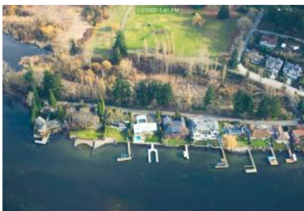
Piers near Juanita Bay

A breakwater typically refers to an off-shore structure designed to absorb and/or reflect wave energy back into the water body. Breakwaters can be floating or fixed in location and may or may not be connected to the shore. These modifications are limited within the City, but can be found at Kirkland Homeport Marina as well as at Juanita Beach Park, where a breakwater has been installed around the overwater boardwalk to shelter the swimming area. Breakwaters have the potential to adversely impact the shoreline environment, including impacts to sediment transport, deflection of wave energy, a decrease in water flushing and water exchange, to name a few. As a result, the installation of new breakwaters should be limited to those circumstances when it is shown to be necessary to support water-dependent uses, public access, shoreline stabilization, or other specific public purpose. In these circumstances, the feature should be carefully designed to avoid, minimize, and then mitigate any adverse ecological impacts.