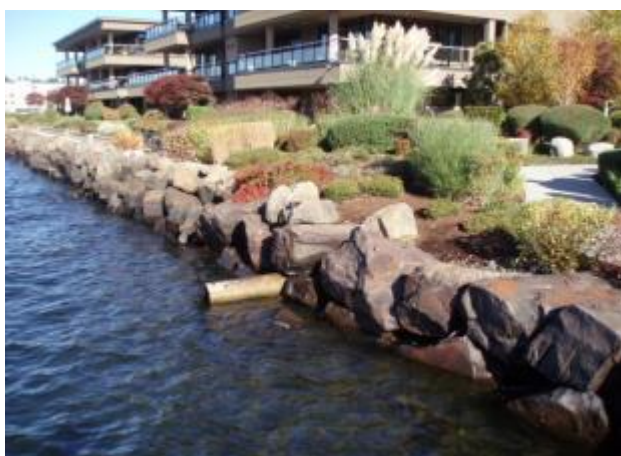
Bulkheads along the lake

Dredging activities can have a number of adverse impacts, such as an increase in turbidity and disturbance to or loss of animal and plant species. Dredging activities can also release nutrients in sediments, and may temporarily result in increased growth of nuisance macrophytes such as milfoil after construction is completed. Dredging can also release toxic materials into the water column. As a result, dredging activities should be limited except when necessary for habitat or water quality restoration, or to restore access, and where impacts to habitat are minimized and mitigated.