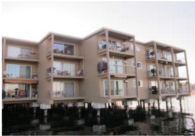
Overwater residences on the lake

Policy SA-6.2: New overwater residences are not a preferred use and shall not be permitted. Existing nonconforming overwater residential structures should not be enlarged or expanded.