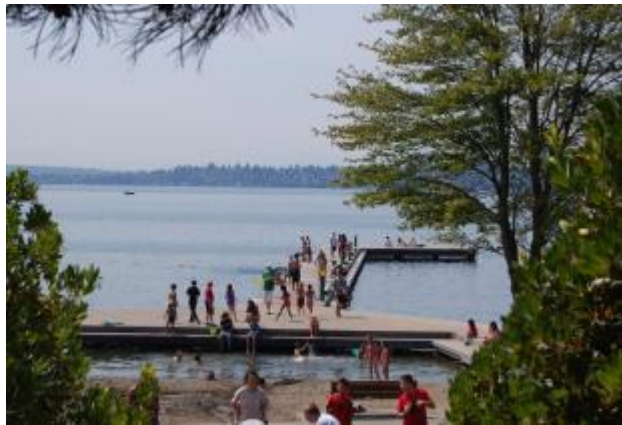
Houghton Beach Park

With miles of shoreline, the City has preserved significant portions of its waterfront in public ownership as parks. Kirkland's waterfront parks are the heart and soul of the City's park system. They bring identity and character to the park system and contribute significantly to Kirkland's charm and quality of life. The 14 waterfront parks stretch from the Yarrow Bay wetlands to the south to Juanita Bay, Juanita Beach and O. O. Denny Parks to the north, providing Kirkland residents year-round waterfront access. Kirkland's waterfront parks are unique because they provide citizens a diversity of waterfront experiences for different tastes and preferences. Park activities and facilities include public docks and fishing access, boat moorage, boat launches, swimming, interpretative trails, and picnicking. Citizens can enjoy the passive and natural surroundings of Juanita Bay and Kiwanis Parks and the more active swimming and sunbathing areas of Houghton and Waverly Beach Parks.