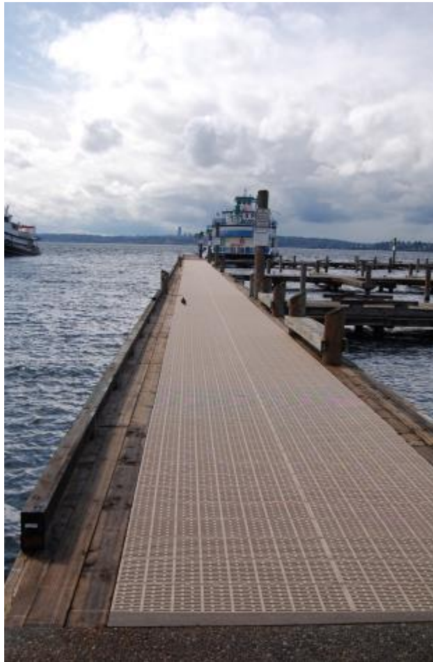
Marina Park pier with grated decking

Policy SA-20.1: Incorporate salmon-friendly pier design for new or renovated piers and environmentally friendly methods of maintaining docks in its shoreline parks.