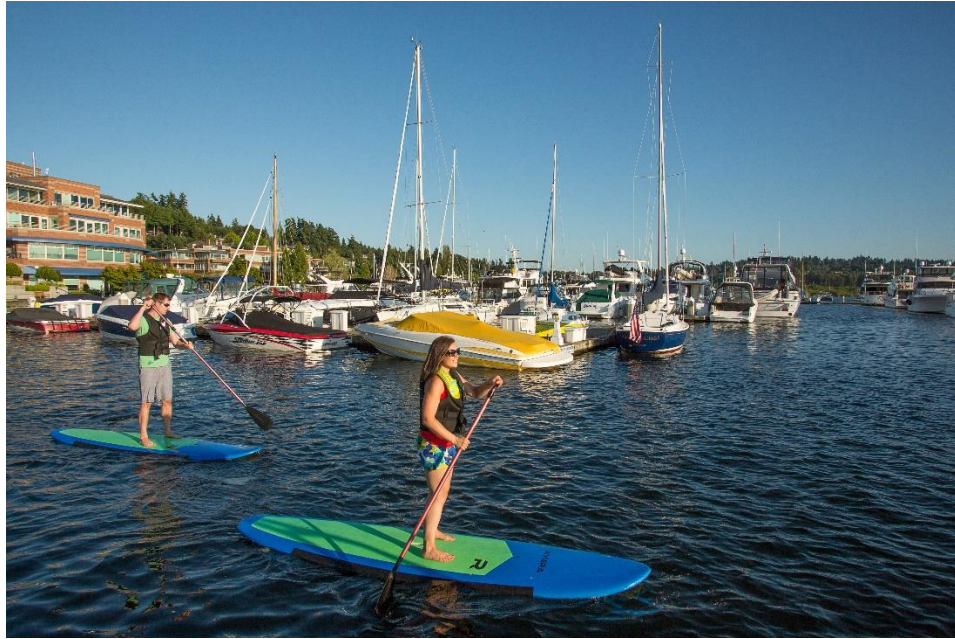
Paddlers enjoying Lake Washington

Policy PR-1.6: Ensure a network of active transportation trails within parks and between parks, nearby neighborhoods, public amenities, and major pedestrian and bicycle routes identified in the Active Transportation Plan.