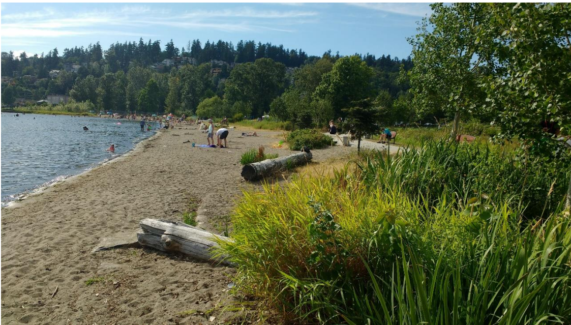
Juanita Beach Park

The Parks, Recreation, and Open Space Element (Parks Element) supports the continued provision of accessible and well-maintained facilities and services for current and future community members. Policies are established to provide and plan for parks, recreation facilities, and open spaces. Policies promote preservation and restoration of publicly owned natural areas for the community and wildlife. The City will continue to coordinate with partners, neighboring cities, and other organizations to seek opportunities for collaboration and further regional approaches for meeting park, open space, and recreational demand.