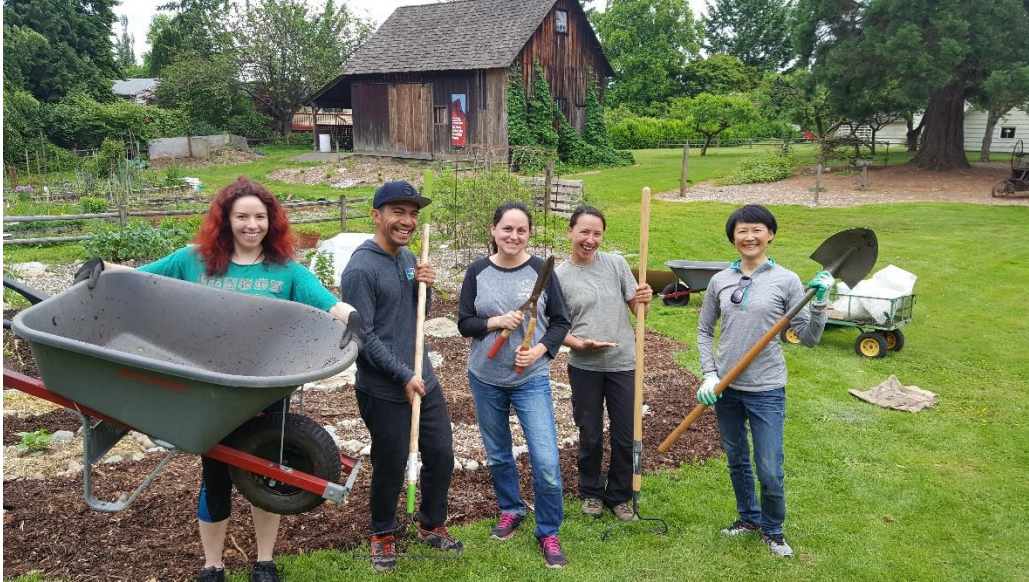
Volunteers at McAuliffe Park