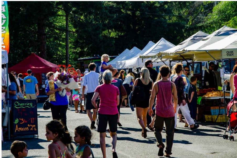
Juanita Friday Market

For example, the City could explore allowing additional recreational rentals, cafes, and food trucks at City parks.