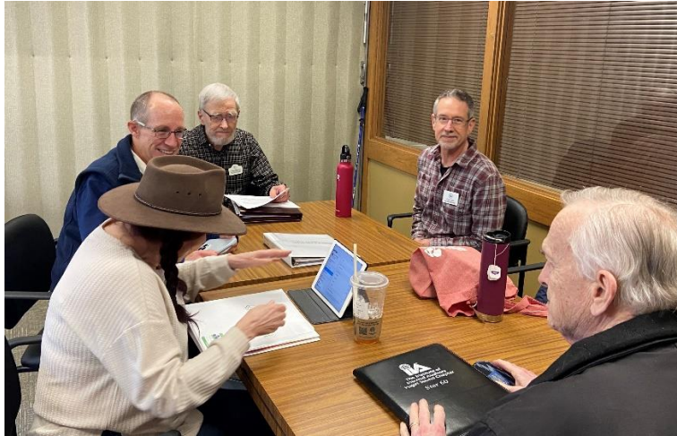
Senior Council members meeting at the Peter Kirk Community Center

Policy PR-2.3: Provide opportunities for safe aquatic recreation through the City's pools and lakefront facilities. Continue to provide scholarships for programs such as swim lessons to encourage participation at all income levels.