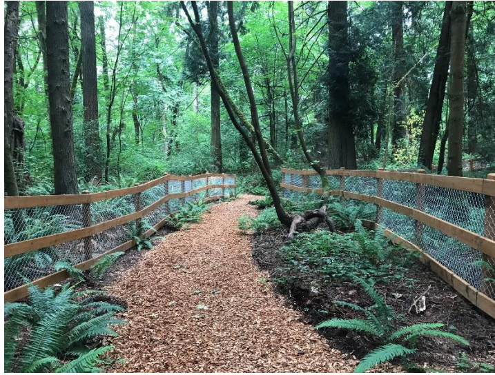
Edith Moulton Park