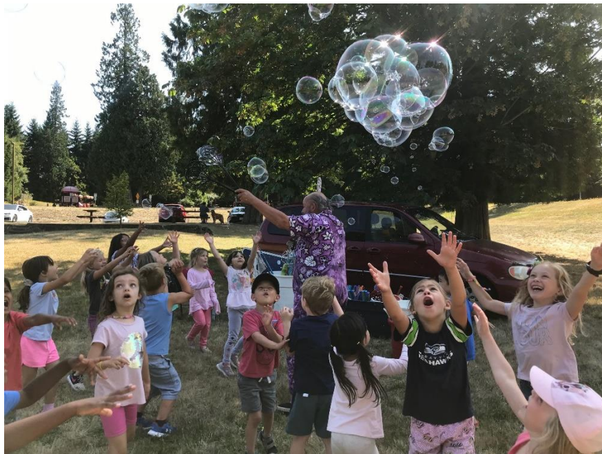
Summer camp in Kirkland