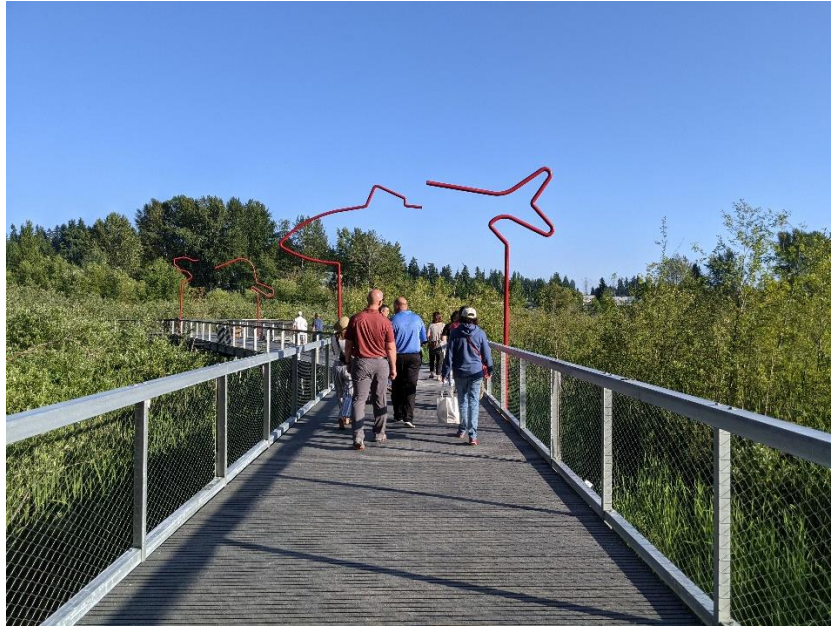
Boardwalk over wetlands at Totem Lake Park

Policy PR-3.2: Restore and manage City-owned or managed natural areas to protect and enhance their ecological health, sensitive habitats, and native species.