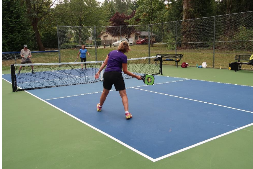
Pickleball Court at Everest Park

Policy PR-2.8: Provide and enable access to a Citywide system of indoor and outdoor sports courts, gymnasiums, and programs for Kirkland community members.