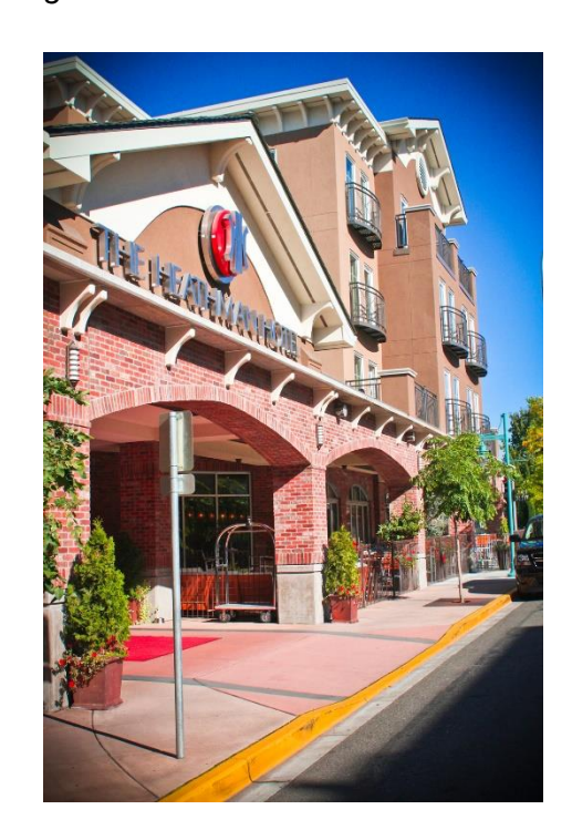
Figure ED-3: The Heathman Hotel

Tourism is an important economic development tool to diversify the economy. Businesses and organizations involved in the visual, cultural, and performing arts, as well as cultural and historic preservation play an important role in Kirkland's economy, attracting residents, visitors, and businesses. Visitors from outside the community spend money in local shops and restaurants, stay in hotels, and attend performing arts events. Tourism creates jobs. Tourism benefits residents by providing increased amenities, community events, and shopping opportunities. Kirkland's tourism marketing focus promotes the city as a vibrant and diverse waterfront community offering unique opportunities to engage with cultural arts, international cuisine, shopping, and recreation opportunities throughout the community.