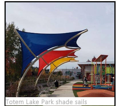
Totem Lake Park shade sails

Background of the Project: In July 2021 the City opened Totem Lake Park as its newest neighborhood park. The park features an accessible playground, restrooms, scenic view locations, environmental restoration and a boardwalk connecting the park through the eastern side of the lake property to the Cross Kirkland Corridor.