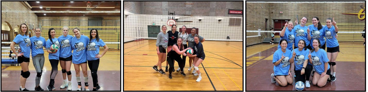
Fall 2023 Volleyball League champion teams.

54 teams competed in various skill divisions in our Fall Volleyball League. The season concluded the week of November 13, 2023 and champions were crowned. Congrats to all the Fall 2023 Volleyball League champion teams!