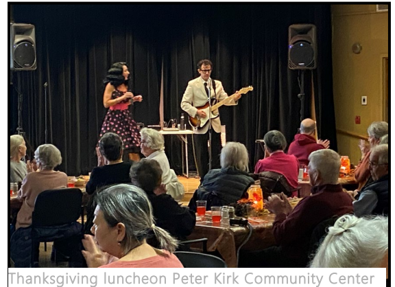
Thanksgiving luncheon Peter Kirk Community Center

The Thanksgiving celebrations started out on November 16 with over 80 seniors enjoying fun entertainment by a Buddy Holly performer. On November 21, MorningStar Senior Living sponsored a Thanksgiving pie give-away for 75 seniors to help make their holiday more delicious. On November 22, the community dining program served a traditional turkey meal with all the trimmings to 70 seniors from Kirkland and the surrounding areas.