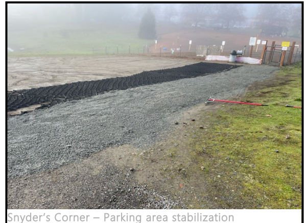
Snyder's Corner – Parking area stabilization