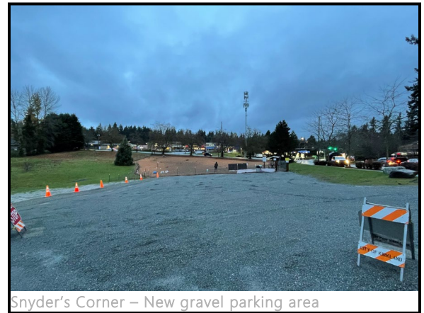
Snyder's Corner – New gravel parking area