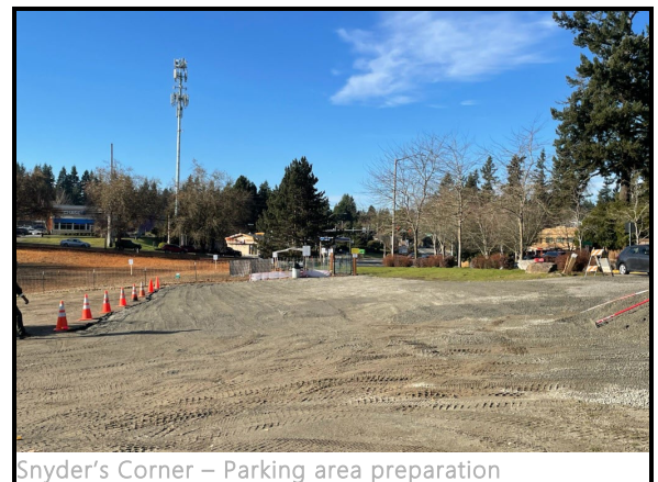
Snyder's Corner – Parking area preparation