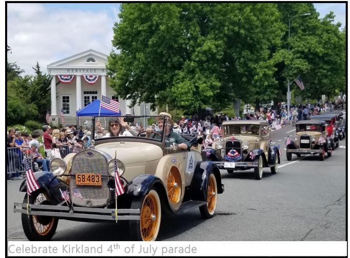
Celebrate Kirkland 4 th of July parade

Events draw people of different cultures, backgrounds, generations, and interests together for a moment in time which allows for shared experiences and new connections. The memories we create with family and friends, both old and new, are what makes events so "special". We look forward to celebrating new moments and creating cherished memories with you in 2023!