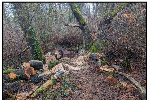
Carillon Woods after tree cleanup