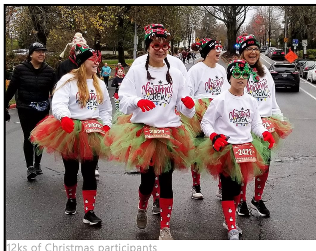
12ks of Christmas participants