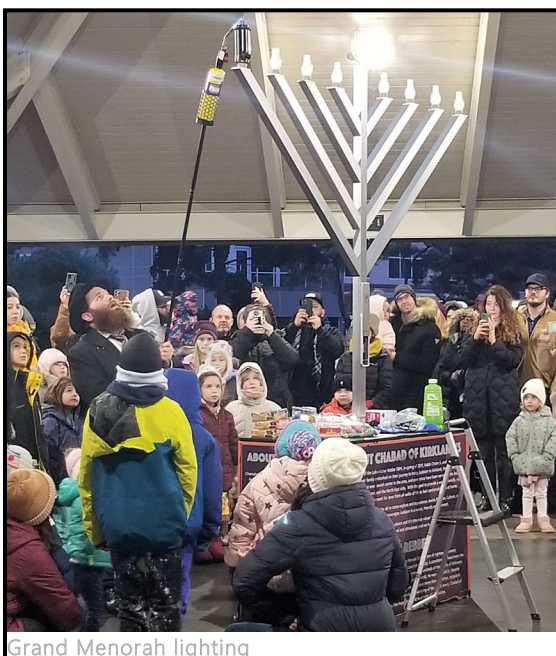
Grand Menorah lighting