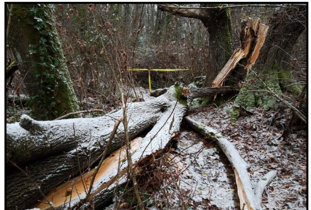
Downed tree at Carillon Woods