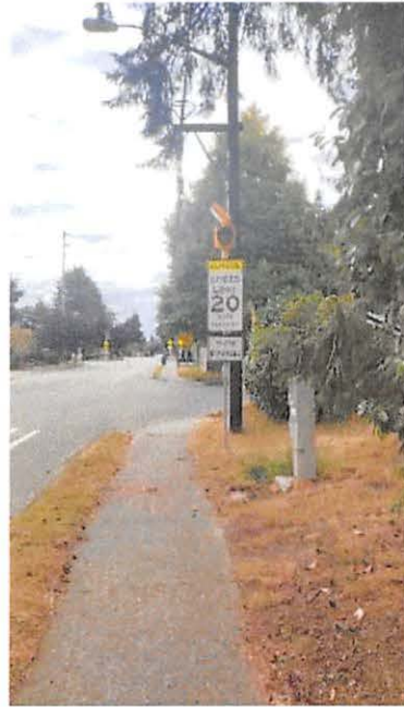
5.3 Photo Enforcement Sign(s):