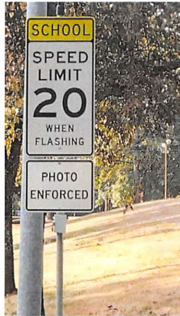
5.3 Photo Enforcement Sign(s):