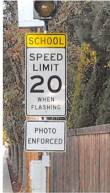
5.3. Photo Enforcement Sign(s):