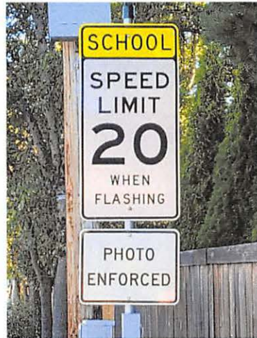
5.3. Photo Enforcement Sign(s):