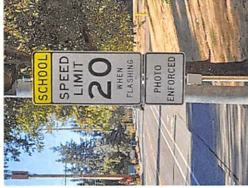
5.3. Photo Enforcement Sign(s):