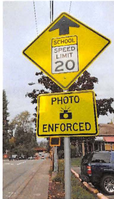
5.3. Photo Enforcement Sign(s):