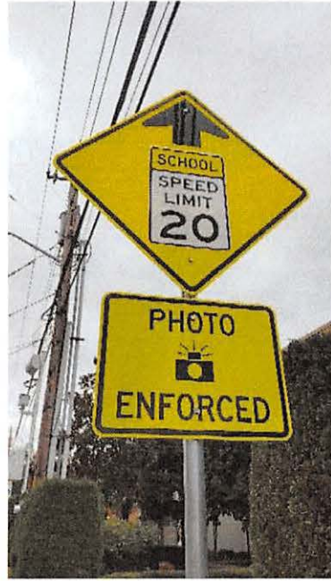
5.3. Photo Enforcement Sign(s):