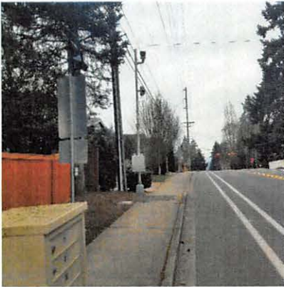
Pole at a distance