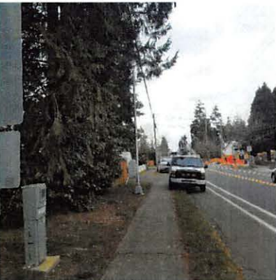
Pole at a distance