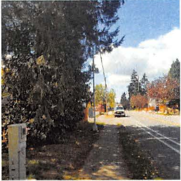
Pole at a distance