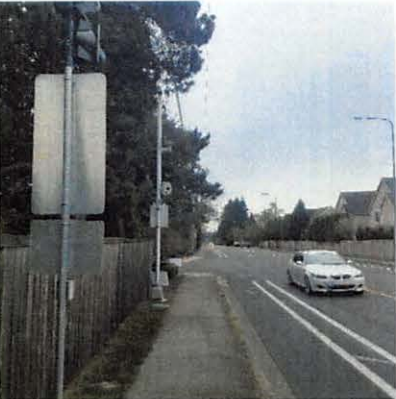
Pole at a distance