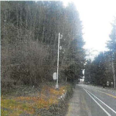
Pole at a distance