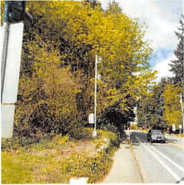
Pole at a distance