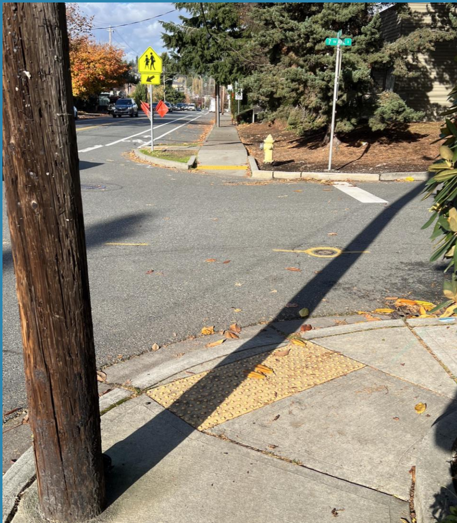
Ground view of the intersection looking north on State Street with 7 th Ave S going off to the right