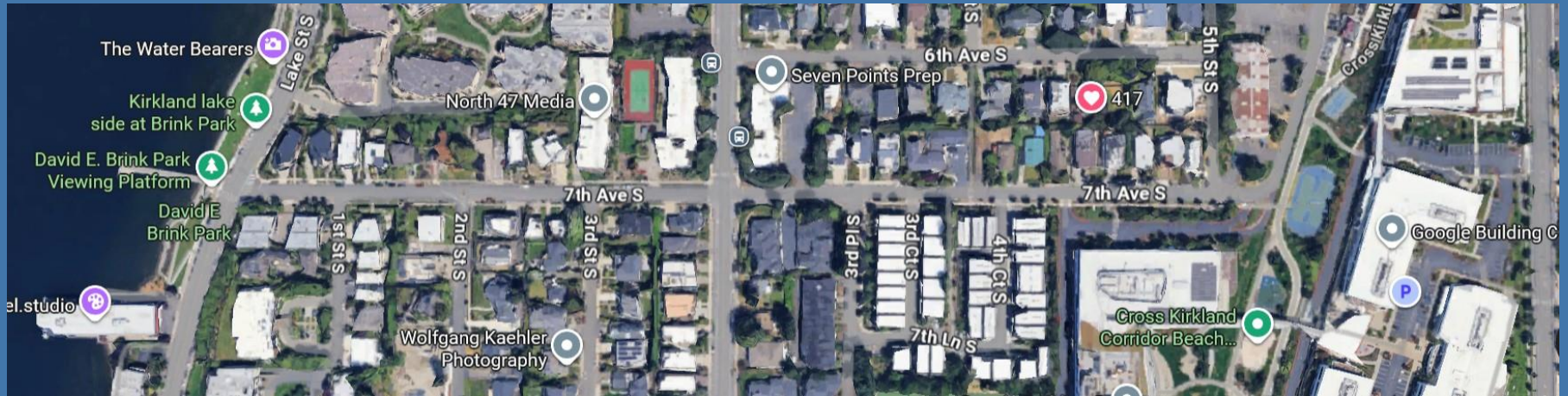
Map snippet showing 7 th Ave S from Brink Park eastward to the Cross Kirkland Corridor trail and Google campus