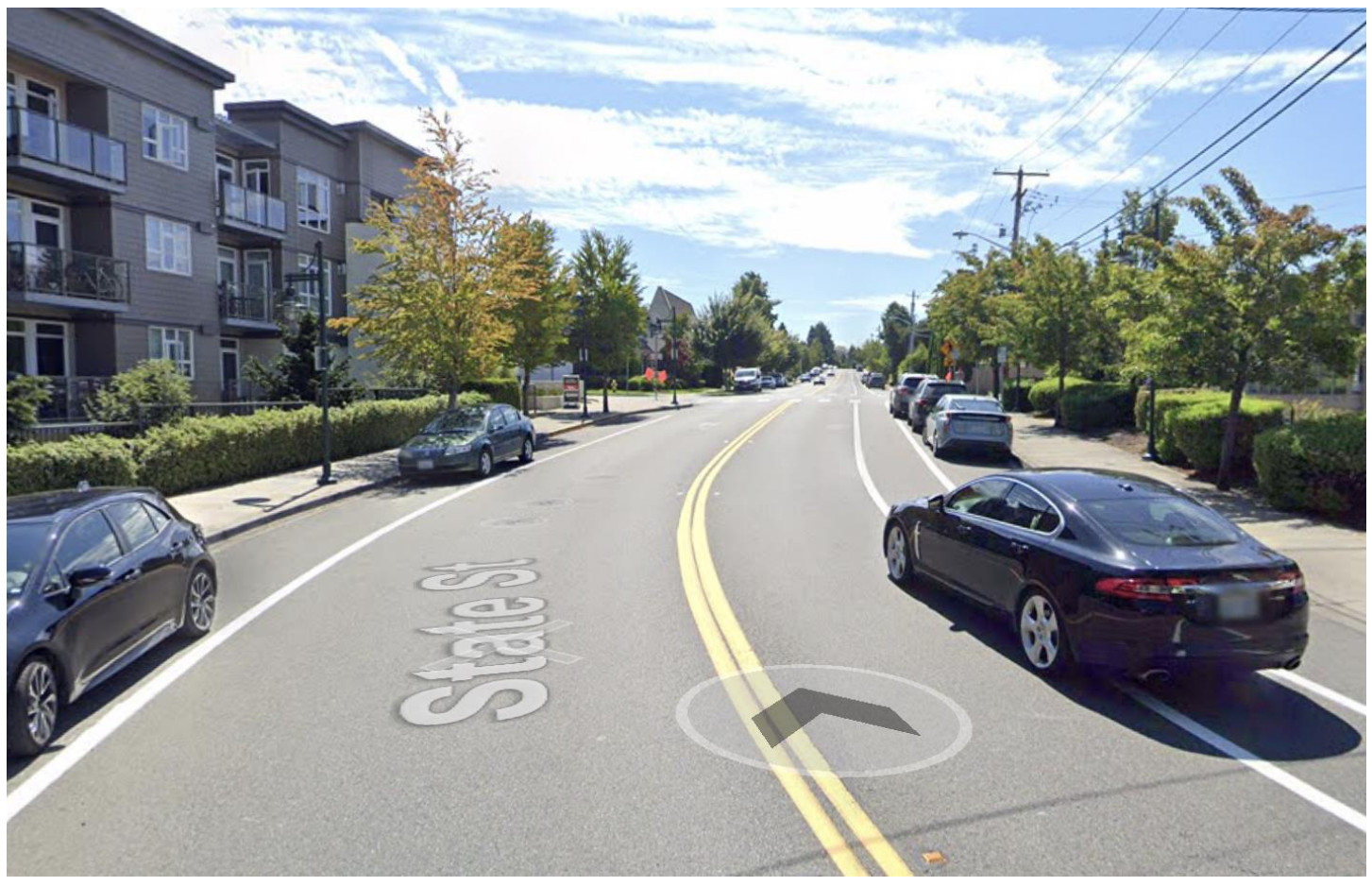
Perspective of southbound traffic coming up the hill.