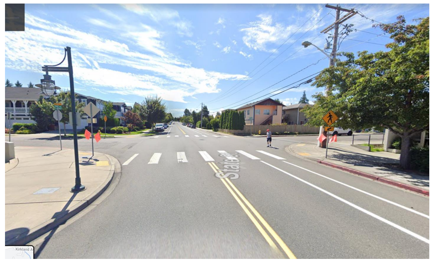
View of the crosswalk, facing south.