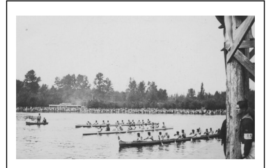
Several tribes gathered in 1933 for a reenactment of the 1855 Treaty of Point Elliott, at Juanita Beach, once the location of a Duwamish village.<sup>26</sup>

The negotiations were conducted using Chinook Jargon, a limited trade jargon taken from French, English, and Native languages. Many Puget Sound people did not speak the concrete shorthand language of a few hundred words, which was adequate for trading goods but not for legal negotiations. Therefore, the treaty was first read in English, translated into Chinook Jargon, and then into two languages of the Coast Salish: Lushootseed and Straits Salish. Given the limitations of the jargon and the fact that the concept of land alienation was unknown to the First People, the language problem produced difficulties in translation. Also, the treaties were made in great haste because Governor Stevens was anxious to negotiate as soon as possible.