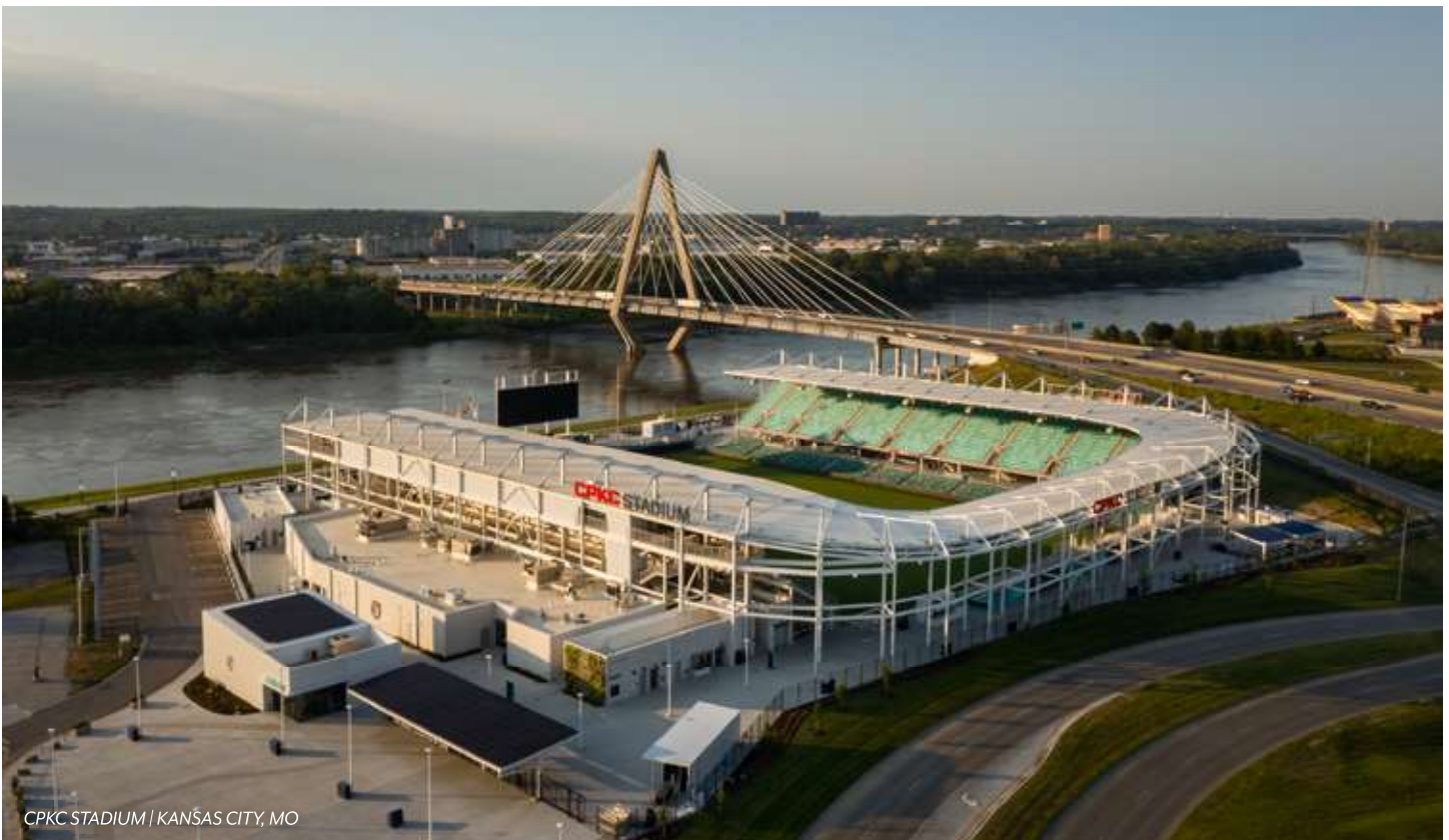
CPKC STADIUM | KANSAS CITY, MO

Roughly 50% of our built work includes documented sustainability measures and we can document and seek accreditation or certification, if desired. The path starts with designing a baseline facility featuring sustainable measures while staying within budget. The degree to which we can employ additional sustainable strategies will be site and program-specific.