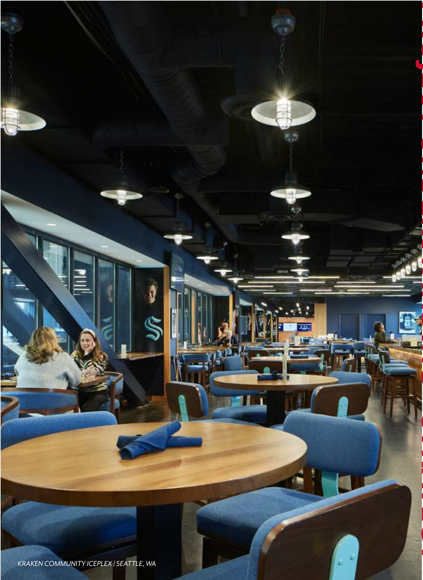
KRAKEN COMMUNITY ICEPLEX | SEATTLE, WA