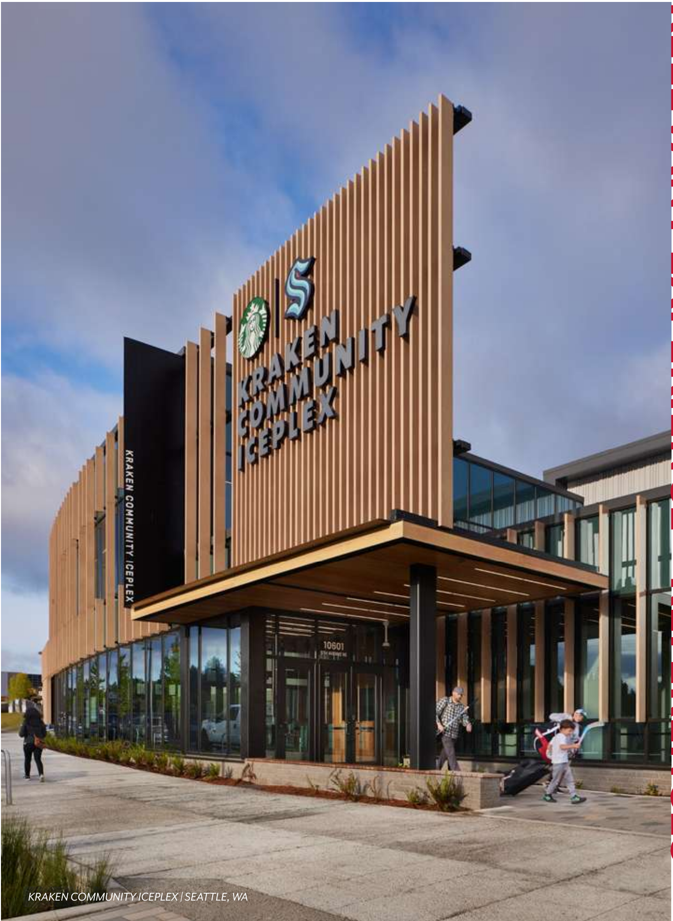
KRAKEN COMMUNITY ICEPLEX / SEATTLE, WA