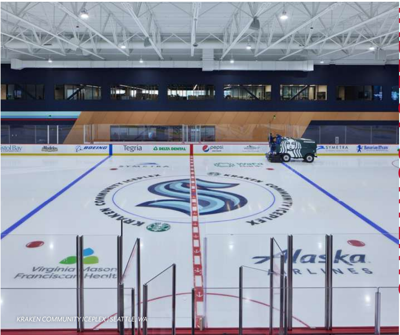
KRAKEN COMMUNITY ICEPLEX | SEATTLE, WA