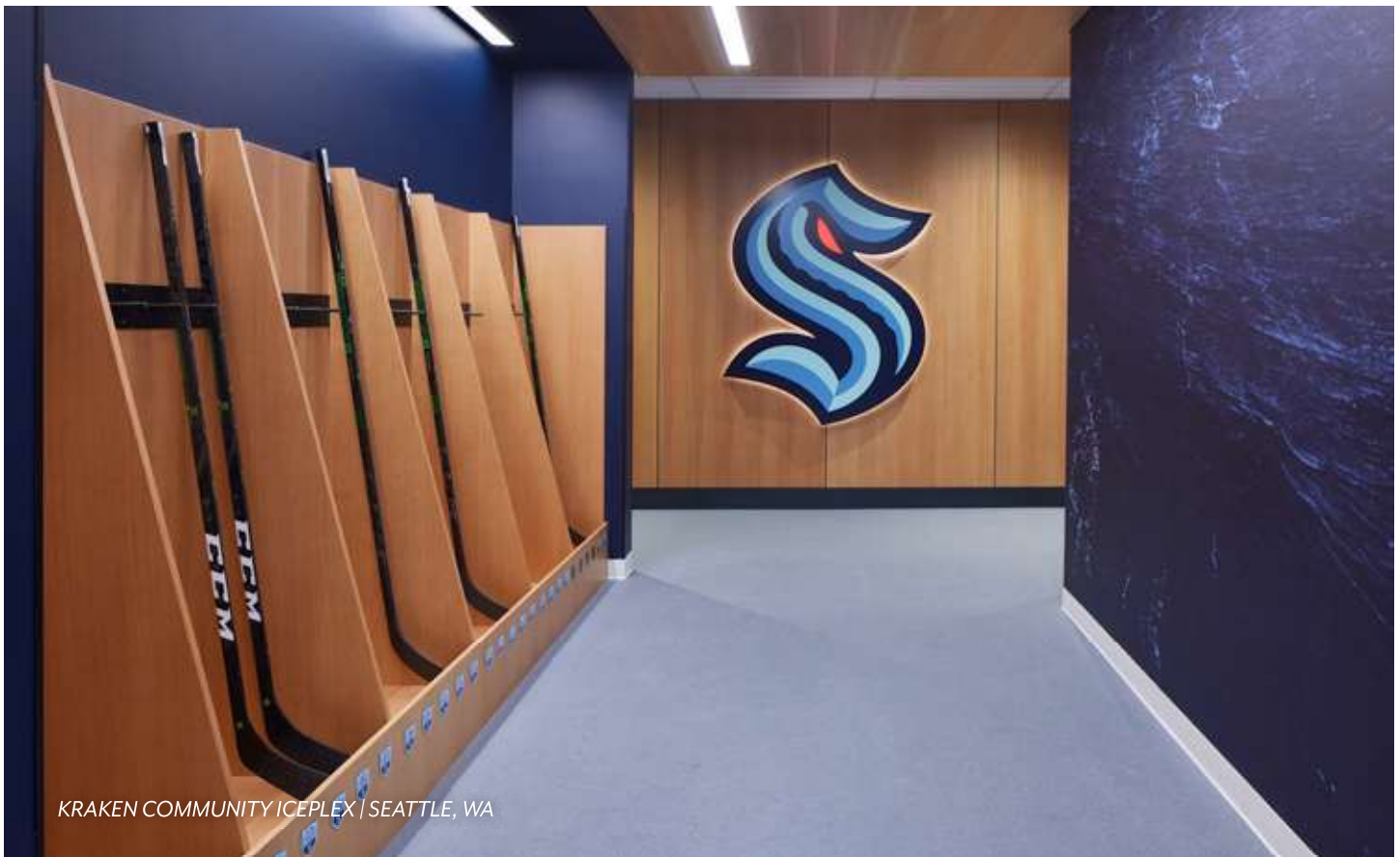
KRAKEN COMMUNITY ICEPLEX | SEATTLE, WA

Seattle Hockey Partners has a banking relationship with WaFd Bank as an official partner, and WaFd financed the Kraken Community Iceplex. Seattle Hockey Partners also has financing relationships with Truist Bank, JPMorgan, and Wells Fargo.