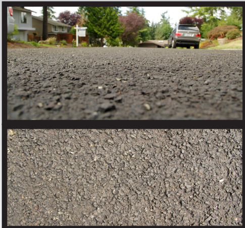
Street: 91st Court Northeast Sealed: Aug. 30, 2016 Photo: Sept. 8, 2016