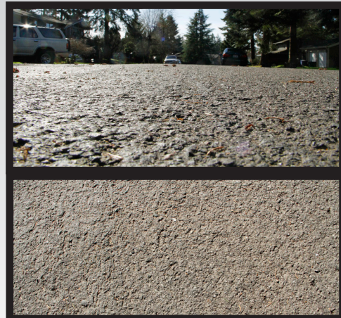
Street: 91st Court Northeast Sealed: Aug. 30, 2016 Photo: April 3, 2017