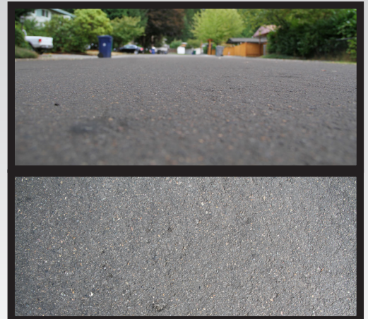
Street: Northeast 131st Place Sealed: Aug. 3, 2015 Photo: Sept. 8, 2016