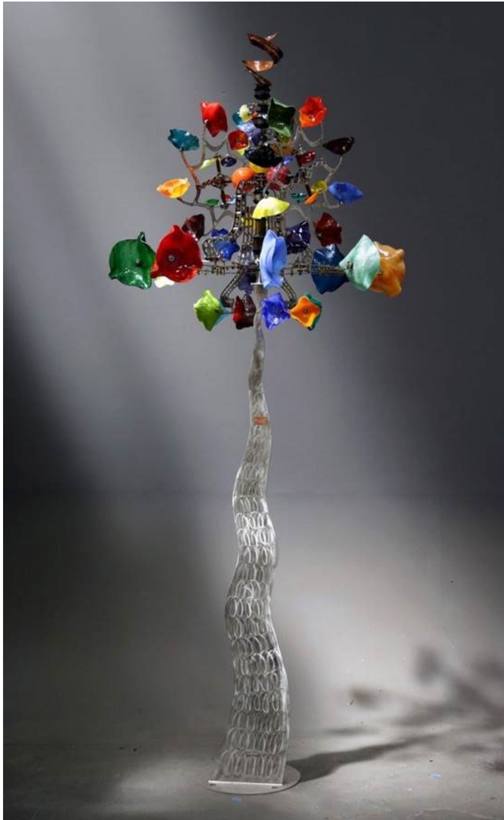
Exhibit A – Glassinator Art Image