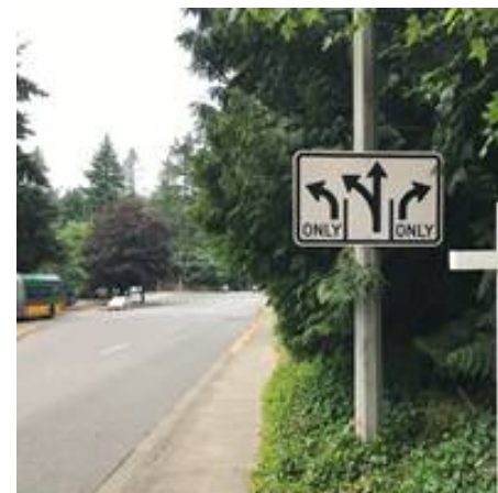
Figure 1: New Lane Configuration Sign on NE 124th Street at 100th Avenue NE, Looking West

The Project improved travel times for 700 to 1,000 transit riders per day by an estimated 30 seconds per bus trip, which equates to almost 10 person-hours saved per day. The work included signal improvements to allow for dual