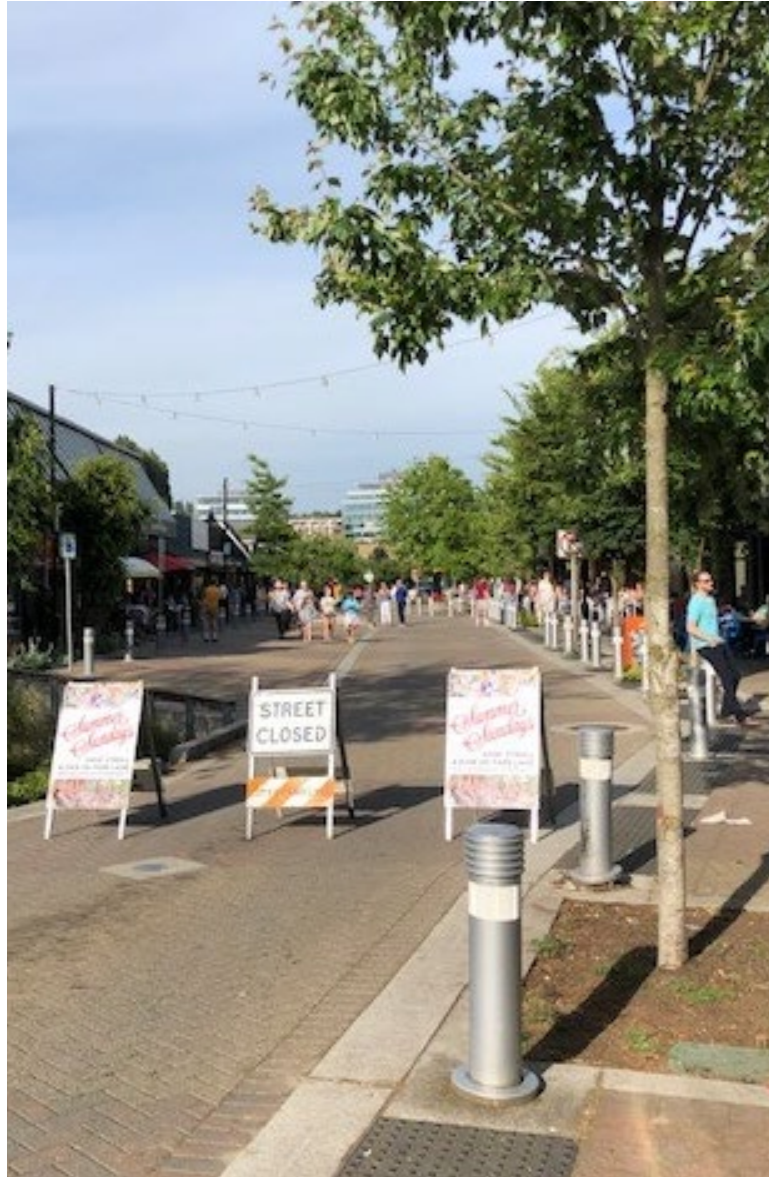
Summer Sundays 2019