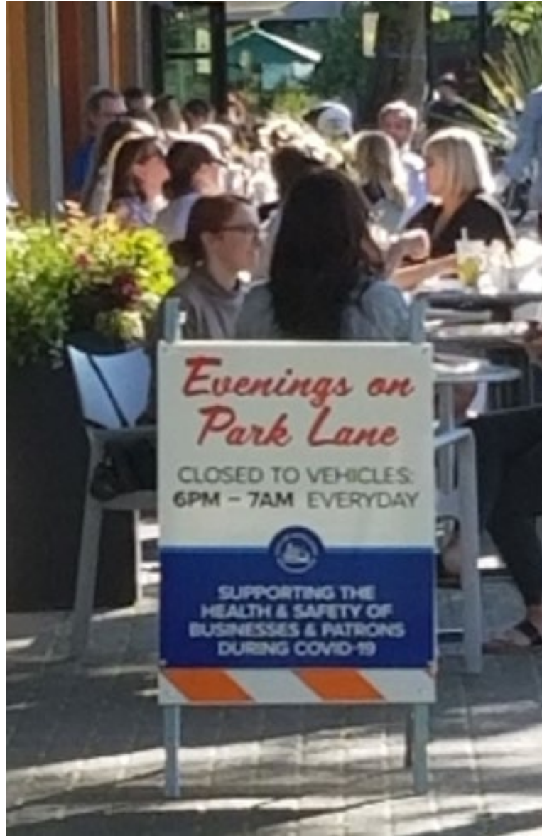
Evenings on Park Lane 2020