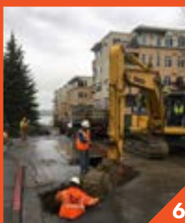
6 SERVICE LINE CONNECTIONS