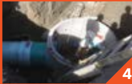
4 MAINTENANCE HOLES