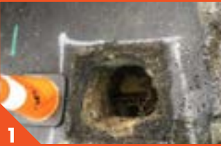
1 POTHOLING /SAWCUTTING

What to expect when Kirkland upgrades water, sewer and stormwater systems