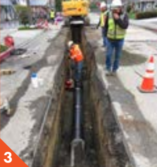
3 INSTALLING MAINS