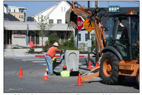
Kirkland's crews install a catch-basin.

Sometimes, these crews will install curb, gutters and catch basins—also known as storm drains—during this process. These structures reduce flooding potential by promoting the flow of runoff. Residents can help reduce flooding potential in their