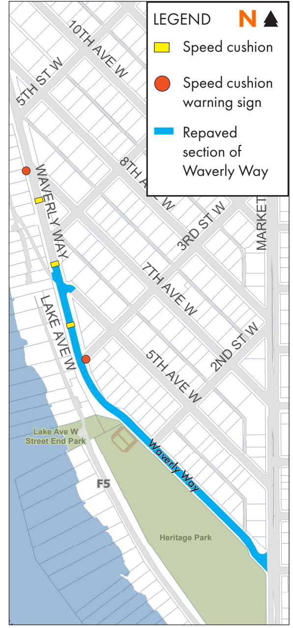
The City of Kirkland is paving Waverly Way, between Market Street and Fifth Avenue West. It is also installing three sets of speed cushions, indicated by the yellow blocks on the map above.