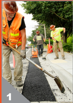
1 UPGRADE CURB RAMP 10-15 work days