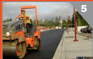
5 PAVE 2-5 work days