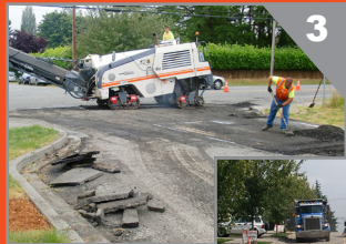
3 GRIND 1-5 work days