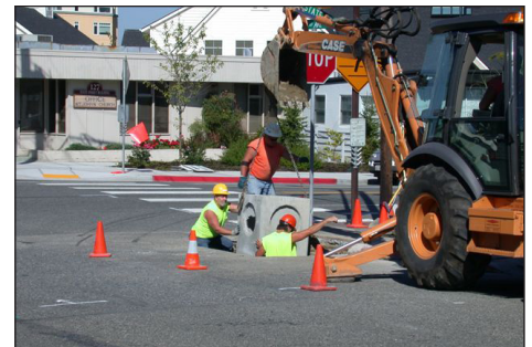
Kirkland's crews install a catch-basin.

Sometimes, these crews will install curb, gutters and catch basins—also known as storm drains—during this process. These structures reduce flooding potential by promoting the flow of runoff. Residents can help reduce flooding potential in their