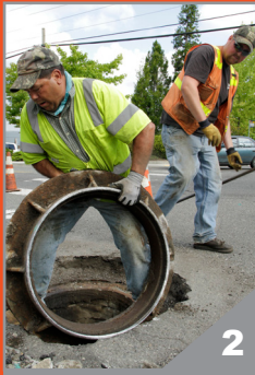
2 REMOVE UTILITY LIDS 3-7 work days