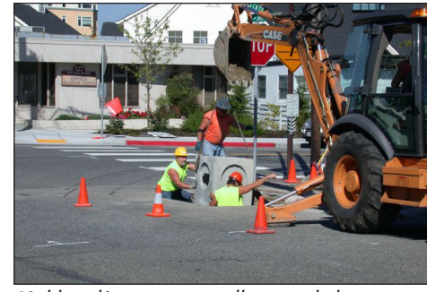
Kirkland's crews install a catch-basin.

Sometimes, these crews will install curb, gutters and catch basins—also known as storm drains—during this process. These structures reduce flooding potential by promoting the flow of runoff. Residents can help reduce flooding potential in their