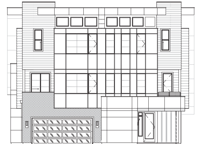
PLAN 1A PLAN 2A BUILDING A RIGHT ELEVATION (Permit Set final elevation)

Unit 2A: The roof deck has been removed. Transom windows have been added to the third floor. Also, the exterior material next to the entry door has been changed to smooth panel with battens.