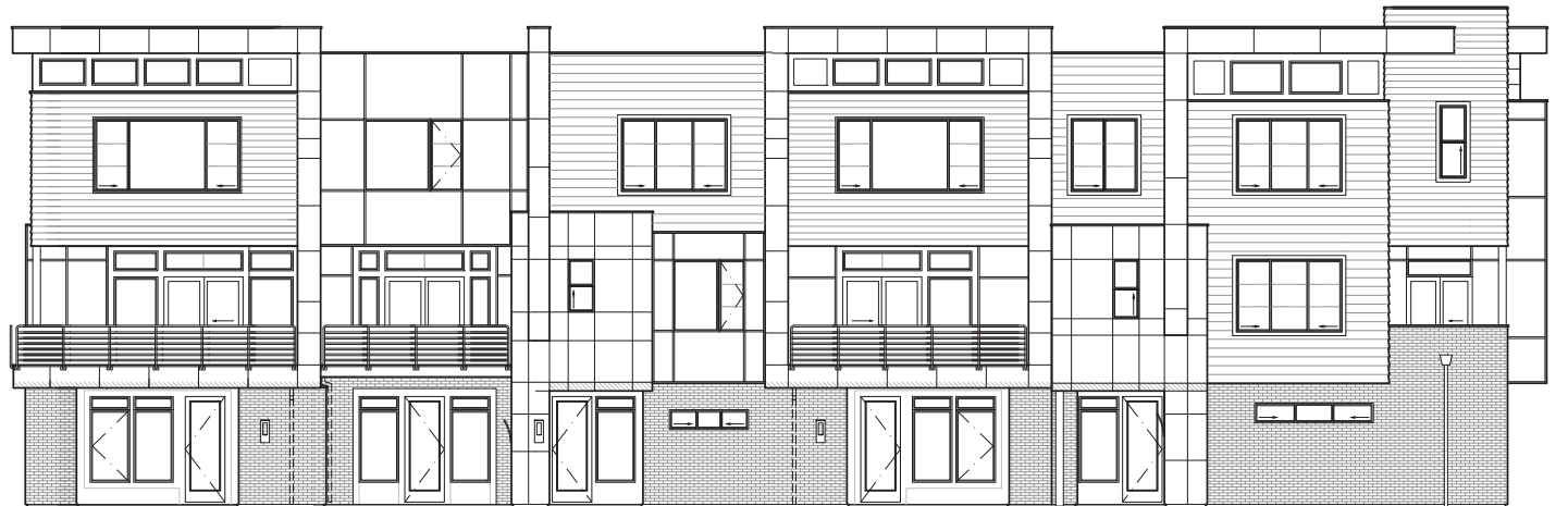
PLAN 8A PLAN 4A PLAN 3A PLAN 8E PLAN 1A

All units: The size of the sidelight windows next to all the front entry doors has been updated.