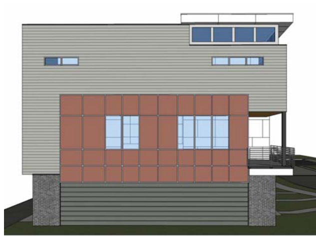
LEFT Plan 8A (Design Review Board proposed elevation)