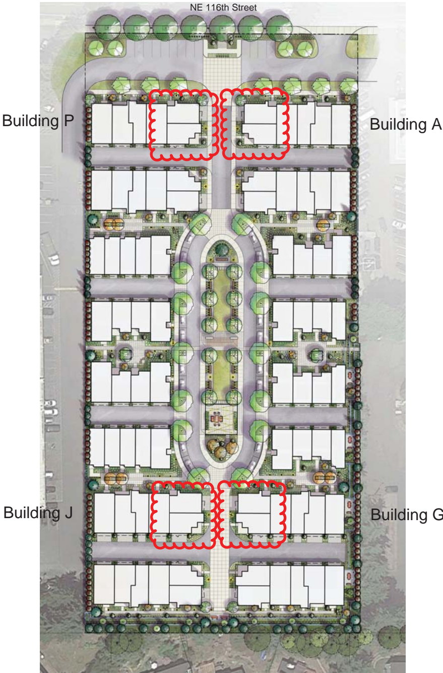
Location of buildings impacted by this change.

All design remains consistent to the original nature, character, color, material choice, layout, regulations, guidelines and Comprehensive Plan without exception.