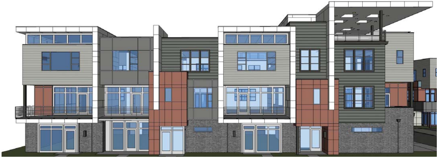
FRONT Plan 8A Plan 4A Plan 3A Plan 8E Plan 1A (Design Review Board proposed elevation)