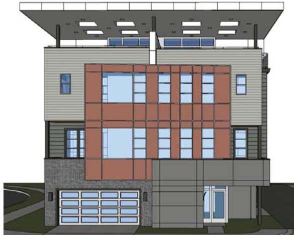
RIGHT Plan 1A Plan 2A (Design Review Board proposed elevation)