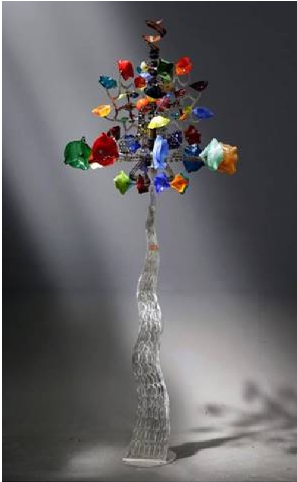
Attachment A – Glassinator Art Image