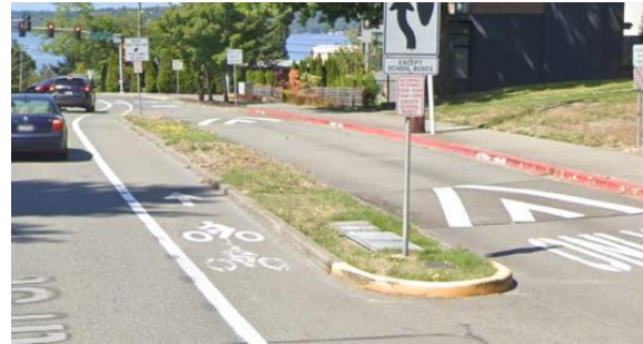
10323 NE 68th St