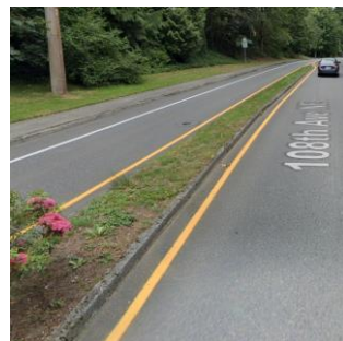
108th Ave NE