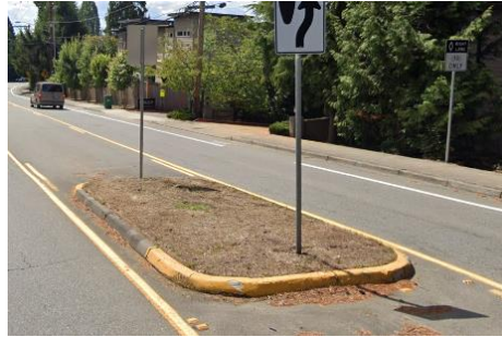
11234 NE 68th St