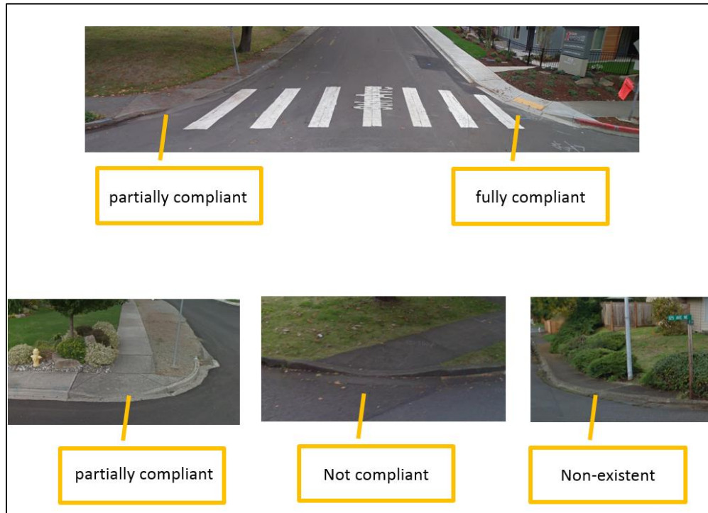
FIGURE 2 IMAGES ABOVE SHOW DIFFERENT SIDEWALK CONDITIONS AND INDICATE WHICH ARE FULLY, PARTIALLY OR NON- COMPLIANT AND NON- EXISTENT

A curb ramp assessment was completed in 2015 in conjunction with a sidewalk assessment. The following images illustrates the criteria used to determine the level of ADA compliance for the curb ramps.