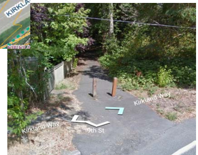
North end of pathway