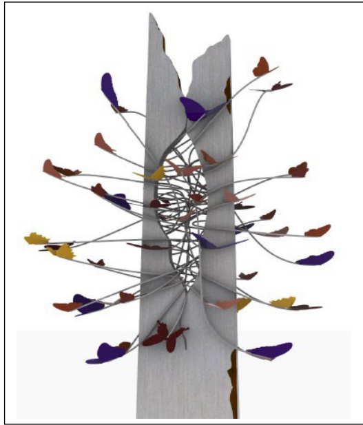
Figure 2: Close up of the butterfly rainbow.