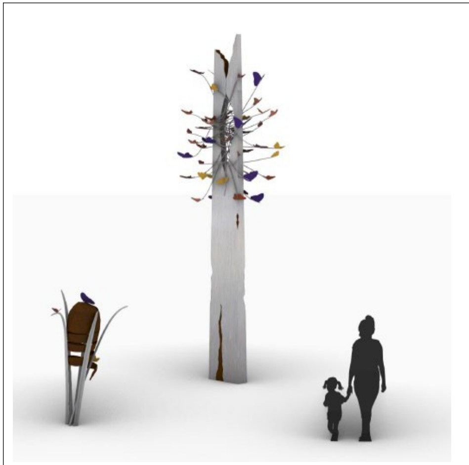
Figure 1: Unfurled cocoon total height is 7'7", the "tree crag" with butterflies is 19'8".

There are six species of butterflies represented, each with its own size, shape, color, and origin. The butterflies were chosen carefully to represent Kirkland's largest immigrant populations as well as those native to the United States and the Pacific Northwest. The artwork also will include a sculptural raven feather and a bald eagle to honor the Duwamish tribes as the original inhabitants of the land that is present day Kirkland. The proposed concept is shown below.