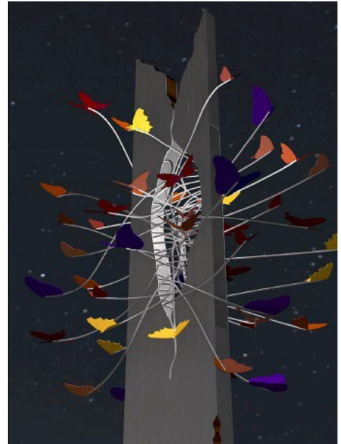
Figure 3: Artwork will illuminate butterflies at night.