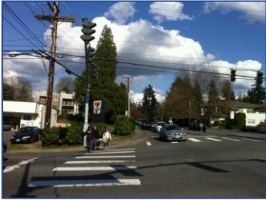
NE 68 th Street and 108 th Avenue NE