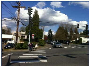
NE 68 th Street and 108 th Avenue NE