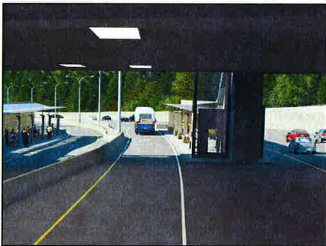
Conceptual rendering of a bus picking up passengers at an Eastside lid and transit station at 92nd Avenue NE.

We are pursuing interagency review of our lid design plans prior to finalizing the preliminary design.