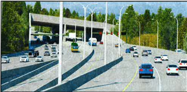
Conceptual rendering of Eastside lane configuration looking west near Bellevue Way.

The Eastside Transit and HOV Project would complete and improve the HOV system from Evergreen Point Road to the vicinity of the SR 202 interchange, a distance of approximately 8.5 miles. The six-lane corridor would have two general-purpose lanes and one HOV lane in each direction.