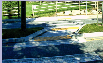
Juanita Neighborhood Connection Crosswalk Enhancement