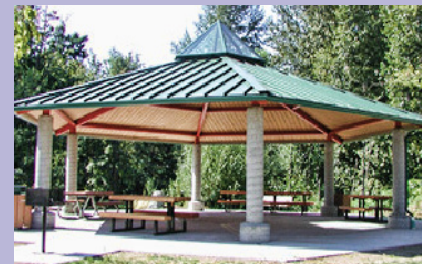
Everest Park Gazebo Joint Rotary Club/Neighborhood Connection Project