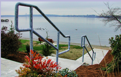
Moss Bay Neighborhood Connection Sidewalk Connection

Taking advantage of work already scheduled by PSE to upgrade a gas line, the link from the Highlands Neighborhood to downtown was restored and fully paid for by PSE.